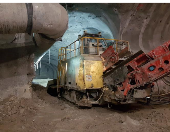
Benching - excavation of tunnel base